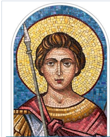
OUR CHURCH OUR SPIRITUAL HOME

Our goal this Ecclesiastical year was to welcome our parishioners to participate as fully as possible in-person in the many ministries and liturgical services offered by our community. Stewardship – the giving of our time, talent, and treasure – is a critical component of our parish community. To each of you who gave of your time and talents dedicated to assisting our church in any way, we thank you.