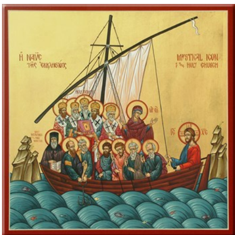
The Ark of the Holy Church